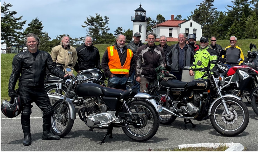
Group photo at the Fort Casey Lighthouse