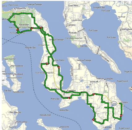
The route covered most of the Island