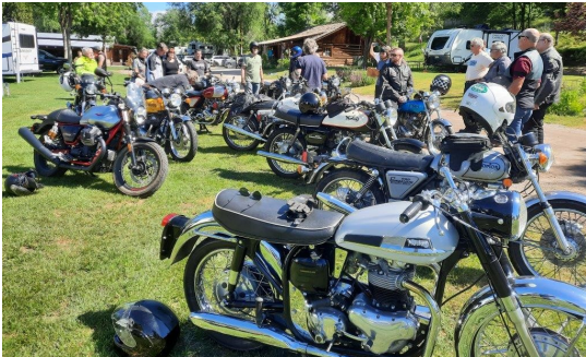
Motorcycles getting ready for the 100 mile ride.